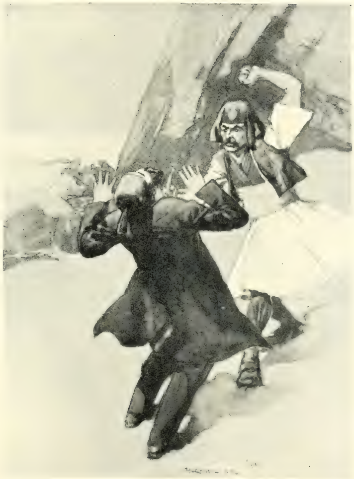
"AT LAST MY GOD, AT LAST!"